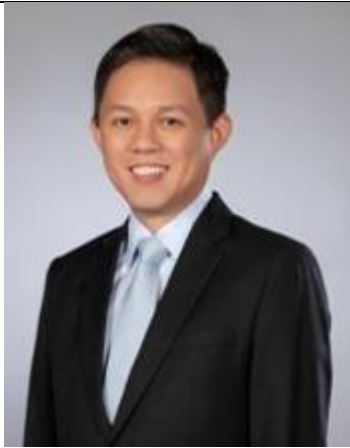
Chan Chun Sing Minister for Education

Mr Chan Chun Sing was appointed Singapore's Minister for Education on 15 May 2021. He is also Minister-in-charge of the Public Service since 1 May 2018.